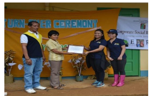
Awarding of the Certificate of Appreciation to PMDC