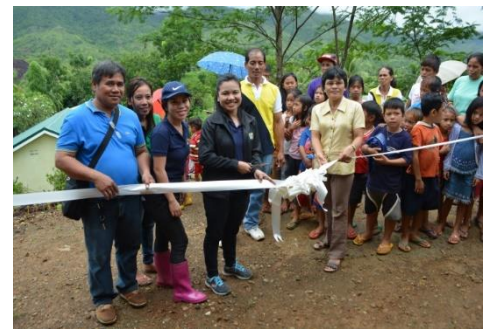
Ribbon Cutting Ceremony