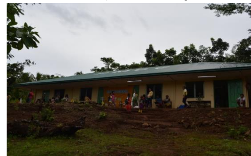
Front View of the donated School Building